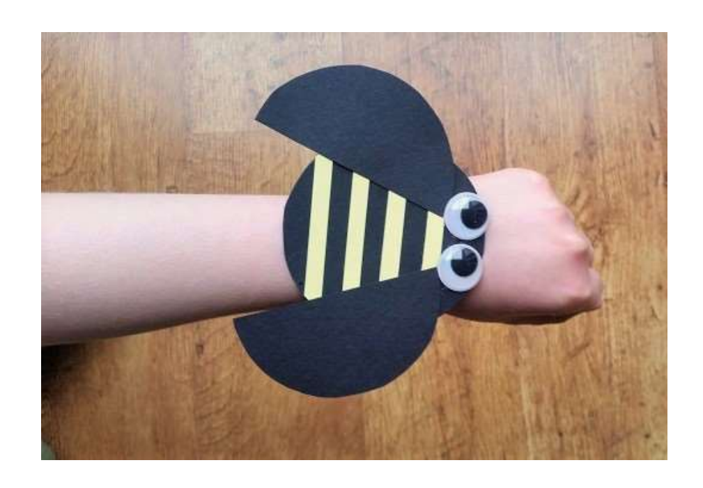
Why not try making other minibeast wristbands?